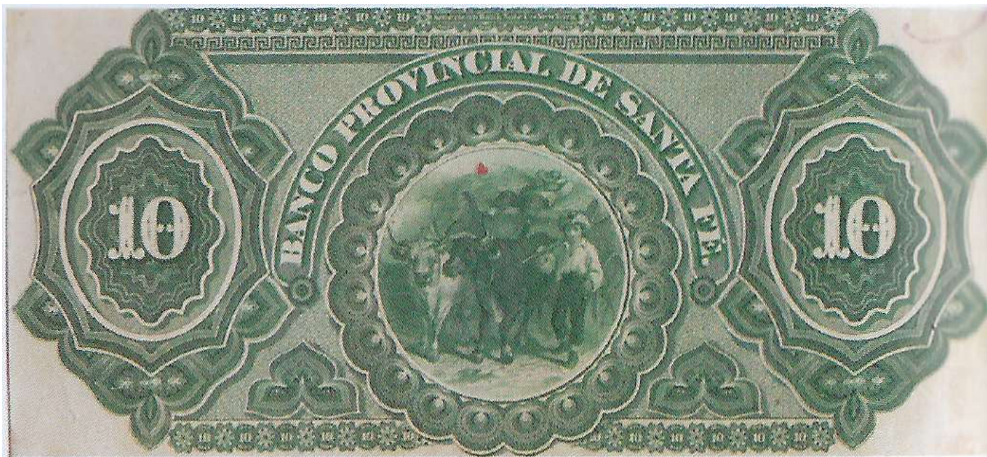
PS-816s SF-3E-4A SFE-223p reverse proof on thin paper glued on cardboard.