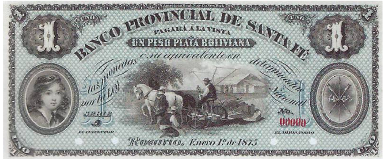
photo Bauman PS-813 SF-3E-1A SFE-221p Reverse proof on thin paper glued on cardboard.

photo Bauman PS-813 SF-3E-1A SFE-221p Serie A – obverse proof with serial n° 00000 on thin paper glued on cardboard, with four cancellation holes