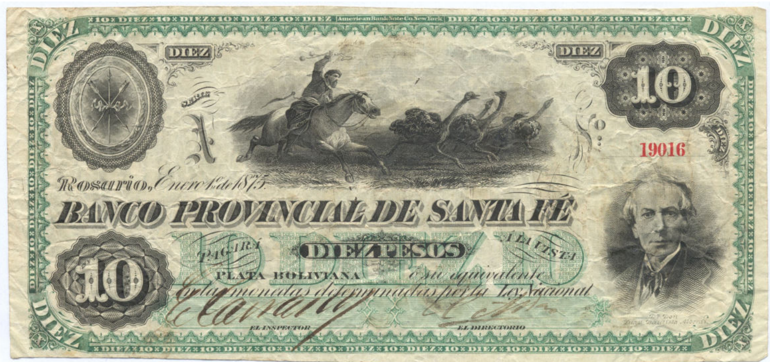
PS-816 SF-3E-4A SFE-223 Issued note of the printing of 1874 with autographed signatures of E. Carrasco and (...)