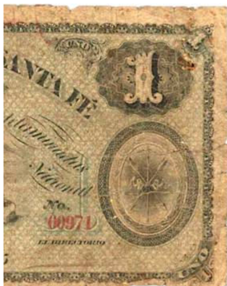
PS-813 SF-3E-2A SFE-221 Serie A -5-digitdialer (11 mm) illegible handwritten signatures.

frame ≈ 165 x 66 mm print run : series A and B, 1 - 150000 PS-813 SF-3E-2A/B SFE 221