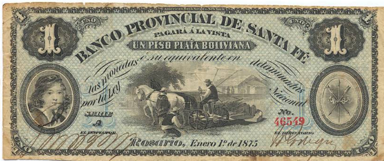
PS-813 SF-3E-2A SFE-221 Série A - 5-digit dialer (13 mm) handwritten signatures of (illegible) and J. Rodriguez ( ?)