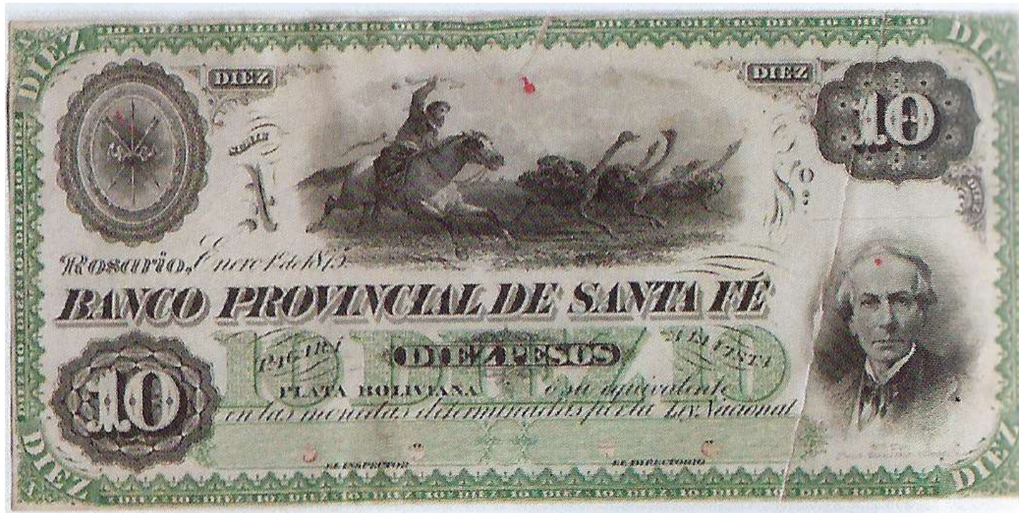
PS-816s SF-3E-4A SFE-223p Obverse proof on thin paper glued on cardboard, Without serial number, four cancellation holes.