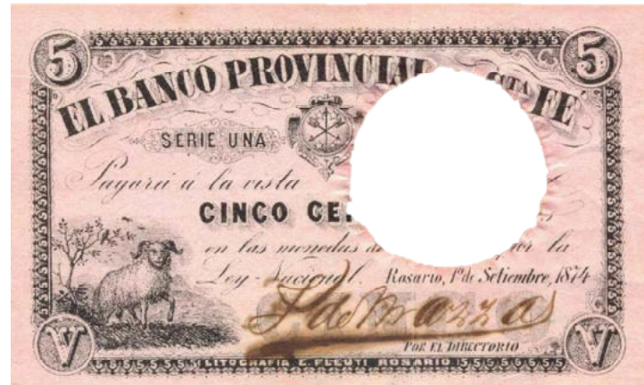
PS-798 SF-1E-1 SFE-200a Pink paper autographed signature of P. de Mazza