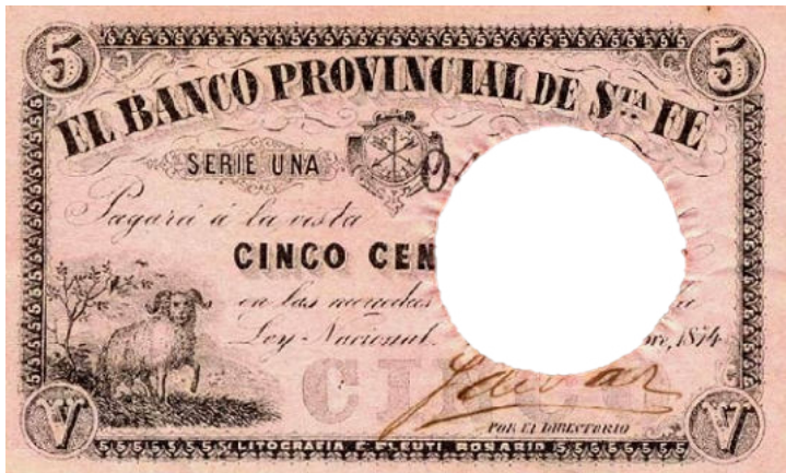
PS-798 SF-1E-1 SFE-200a Pink paper autographed signature of Paz

frame \approx 90 x 53 mm uniface PS-798 SF-1E-1 SFE 200