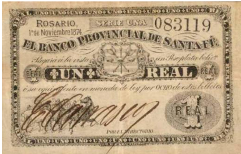
PS-804 SF-2E-1 SFE-210 black printing issued note, autographed signature of E. Carrasco. Note the size of the first digit of the number, significantly smaller than the following. A modified 5-digit dialer may have been used.

PS-804 SF-2E-1 SFE-210b Black printing on pinkish red paper (Nº 030479) (Chao p. 296)