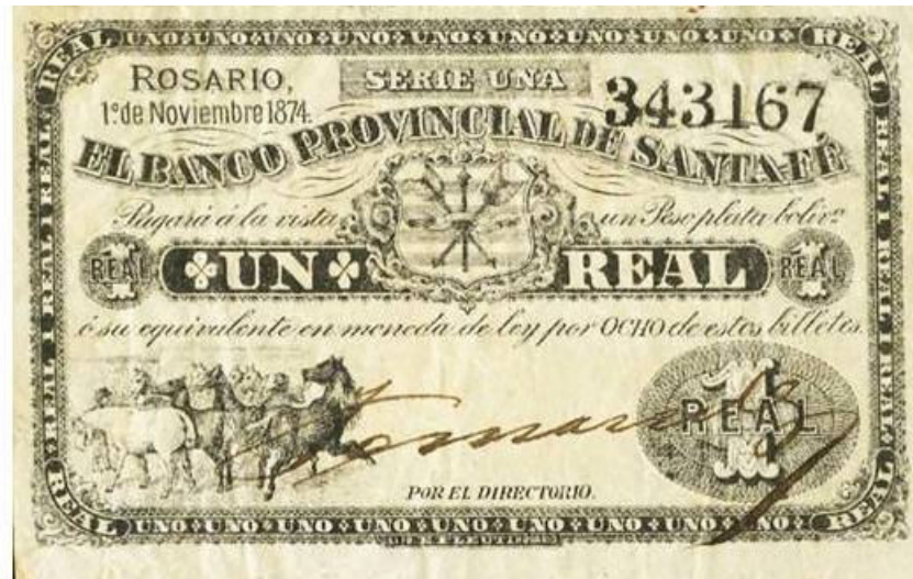
PS-804 SF-2E-1 SFE-210 black printing issued note, autographed signature of J. Fernandez.