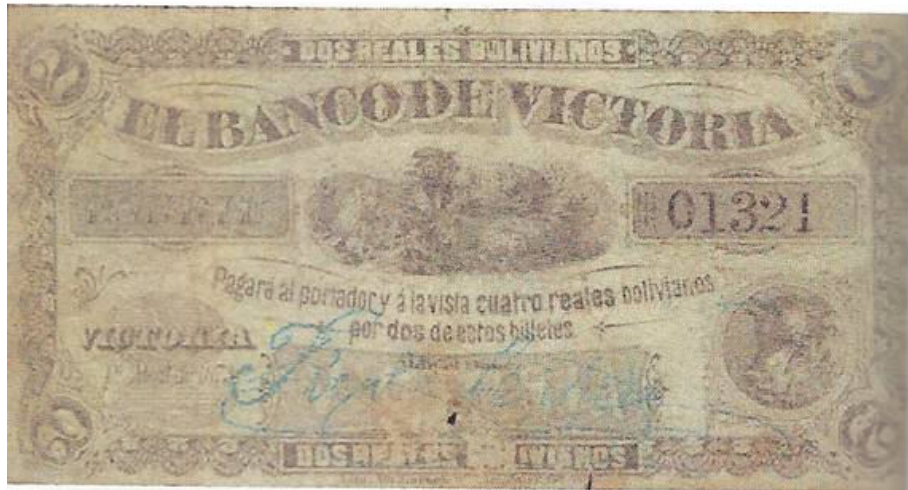
PS- ENR-214 Issued note