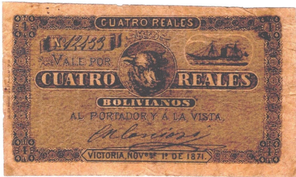
sale August 2015