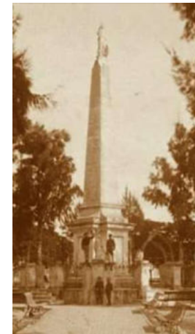
The Pyramid of Freedom, designed by Francisco Madariaga and erected on April 30, 1871 by its builder Domingo Ravagnan with the help of 8 soldiers from Victoria Division

The reverse side was designed with a white area, maybe for a watermark, apparently filled out with a mirror-like image of the bull.