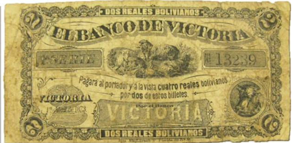
PS- ENR-214 Unsigned remainder