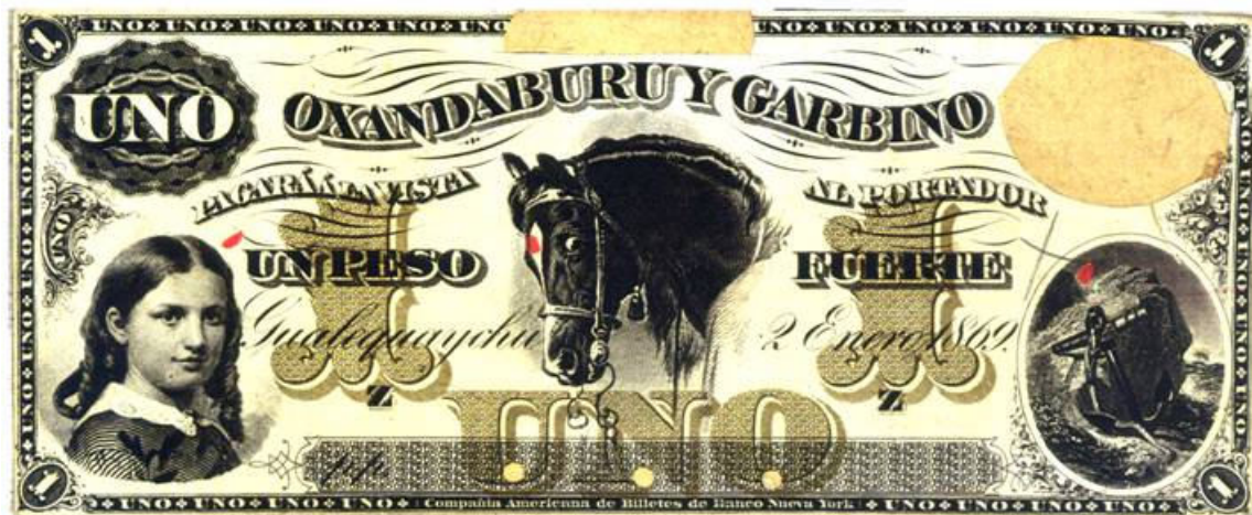
PS-1791P ENR-124p ↑ unnumbered obverse proof with olive underprint on thin paper glued on cardboard. Three cancellation holes.