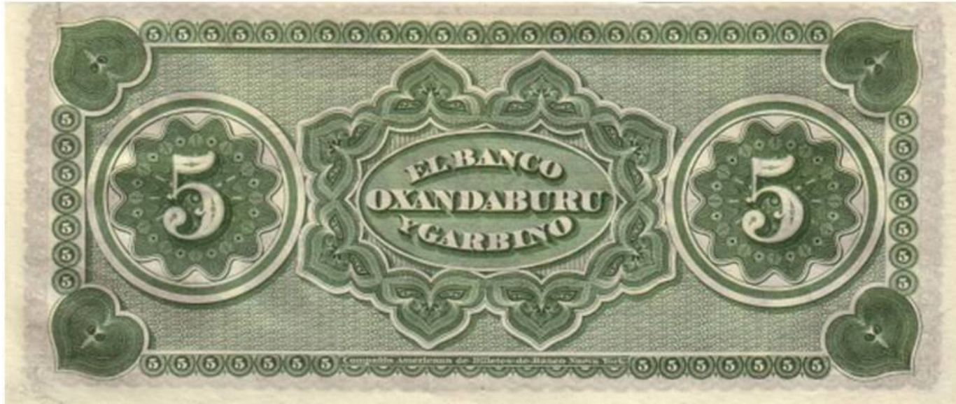
PS-1792p ENR-125p Reverse proof in dark green color.