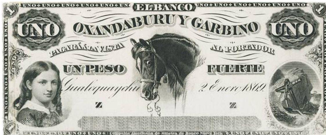
↓ proof of the engraved plate of the obverse without « pp » on the signature field.