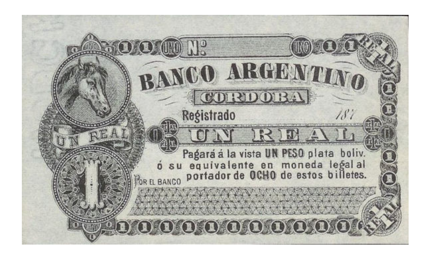
PS-1472 COR-41r BA-7E-2-b Unnumbered and unsigned form date to be completed by hand

PS-1472 COR-41 BA-7E-2-b Issued note No illustration available to date