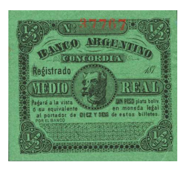
PS-1451 ENR-54r BA-7E-1-a unsigned form, mechanical dialer date to be completed by hand

PS-1451 ENR-54 BA-7E-1-a Issued note No illustration available to date