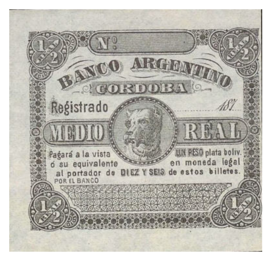
PS-1471 COR-40r BA-7E-1-b Unnumbered and unsigned form date to be completed by hand

PS-1471 COR-40 BA-7E-1-b Issued note No illustration available to date