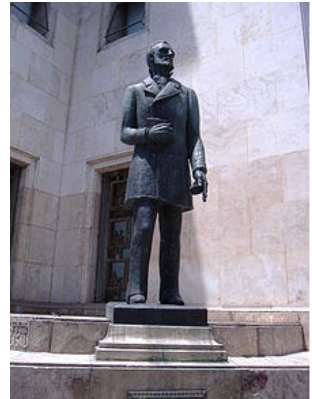
Statue of Carlos Casado, next to the headquarters from Nuevo Banco de Santa Fé at Rosario.

Carlos Casado is believed to have been the richest man in the country at the time and the largest landowner in Argentina's history: his land equaled in area that of the United Kingdom and the Netherlands. In 1874, he was the first president of the Banco Provincial de Santa Fé, but resigned this post after only a few days. In 1883, he founded the West Santa Fe Railway. Carlos Casado died in 1899, leaving an immense fortune built on the backs of indigenous people reduced to slavery. He was the typical representative of the República Conservadora , developing the agro-export model during the governments of Roca (1880 - 1886 and 1898 - 1904).