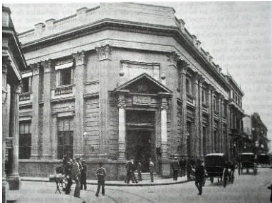
Headquarters of the bank in Buenos Aires around 1880, at the corner of Piedad and Reconquista

Although the agencies of Córdoba and Rosario bear the same name, they were authorized by provincial laws and were therefore subject to different regulations. De facto, they were completely independent of each other.