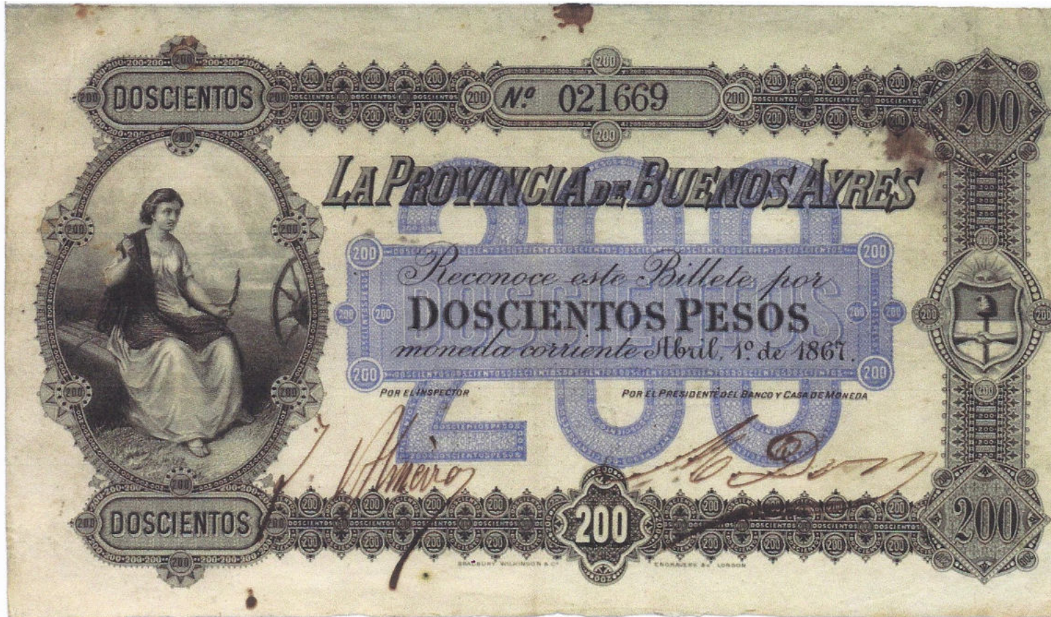
Signatories : José Almeida and Manuel Dorr

PS-477 NC-210 BA-116 ≈ 205 x 120 mm reverse: identical background print. print run : 250'000