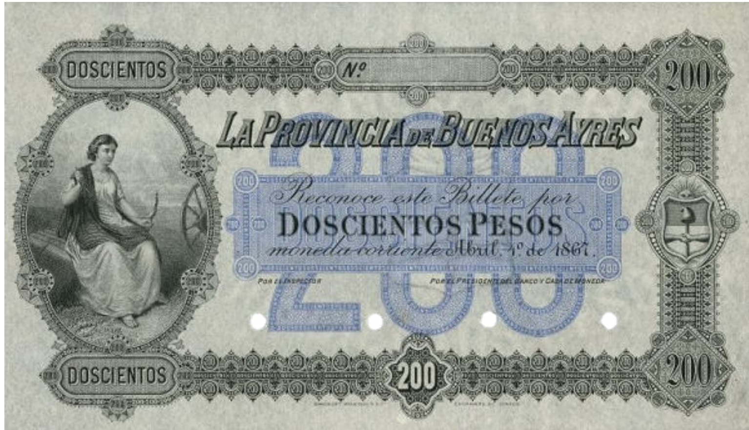
specimen photo