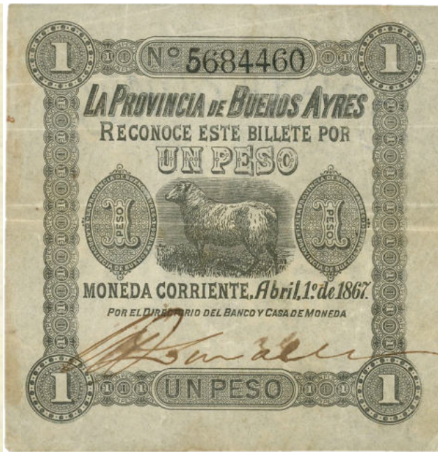
sig. M. Lavalle