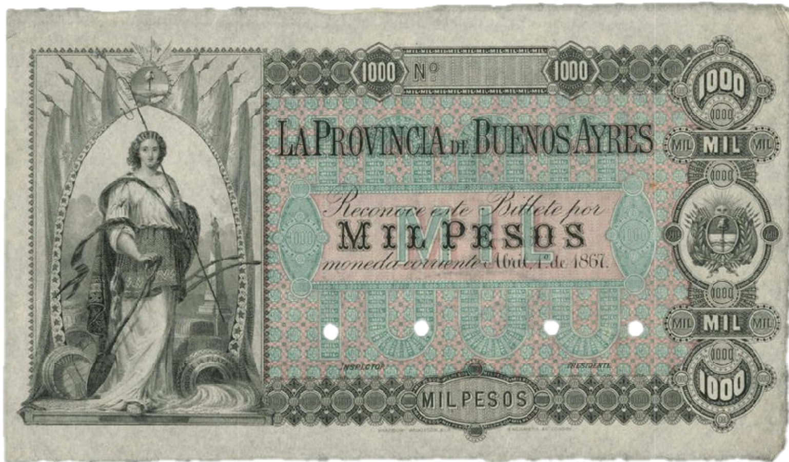
PS-479 NC-212a BA-118s Unnumbered proof with four perforations