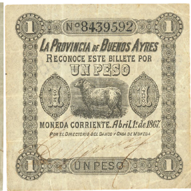
sig. E. Núñez