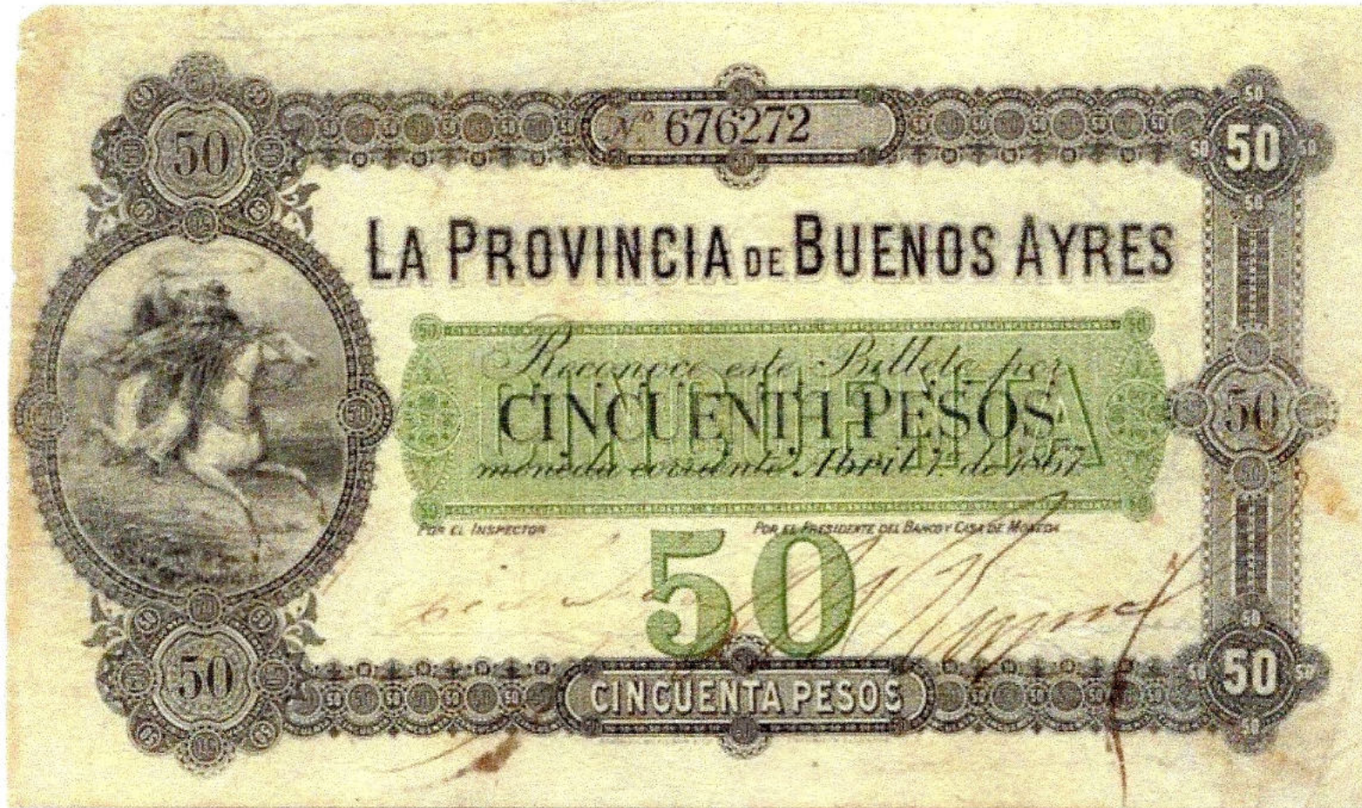
sig. Aquilino Ochagavía ? / Mariano Reynal

PS-475 NC-208 BA-114 uniface ≈ 205 x 110 mm print run : 800'000