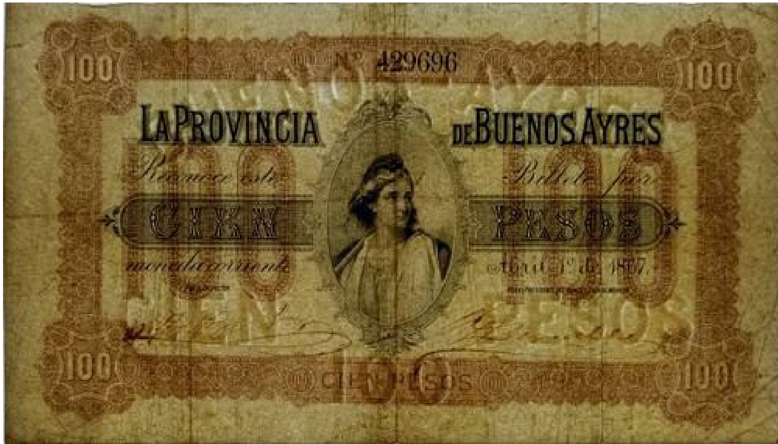
BUENOS - AYRES CIEN PESOS 100