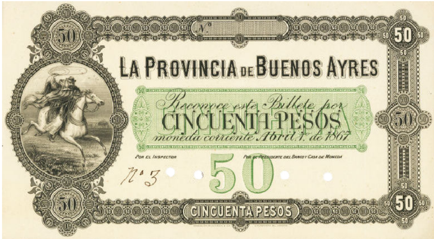
28 avril 2014, lot 22009