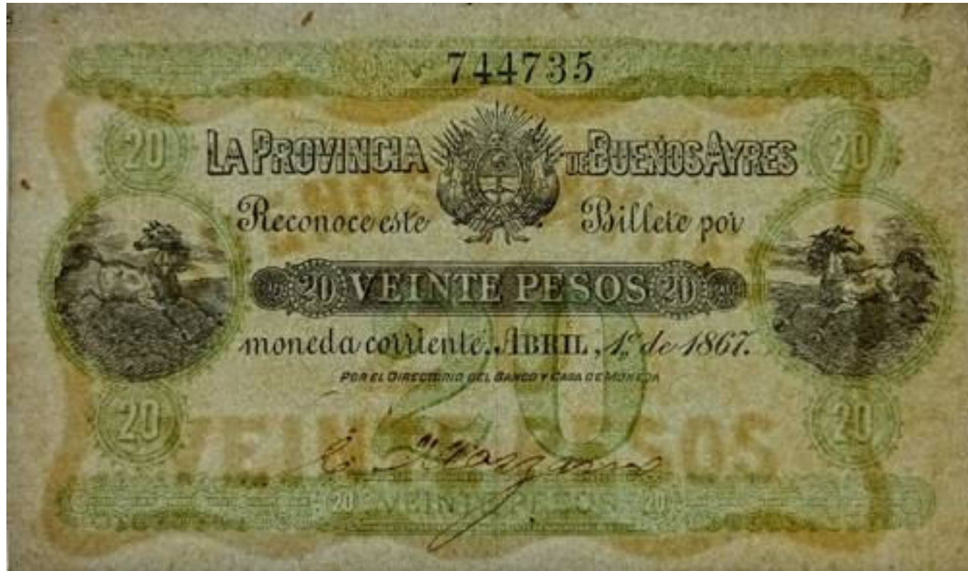
BUENOS - AYRES 20 VEINTE PESOS