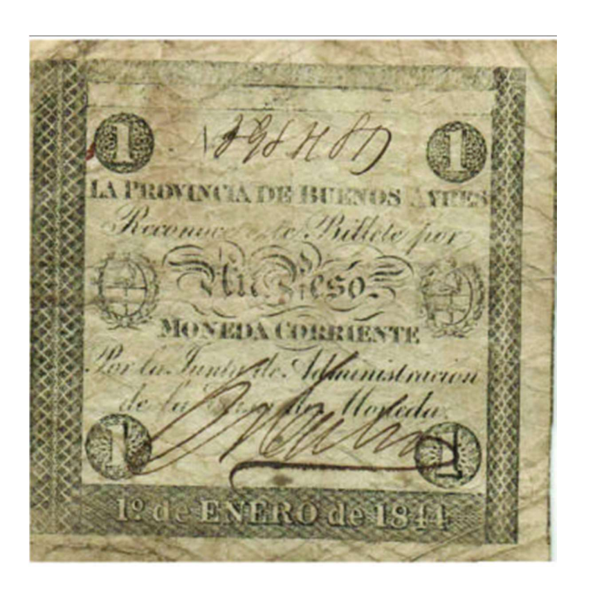
PS-403- NC-158c BA-56a 1^{\circ} de Enero de 1844 the first legend is obliterated, the second one erased.