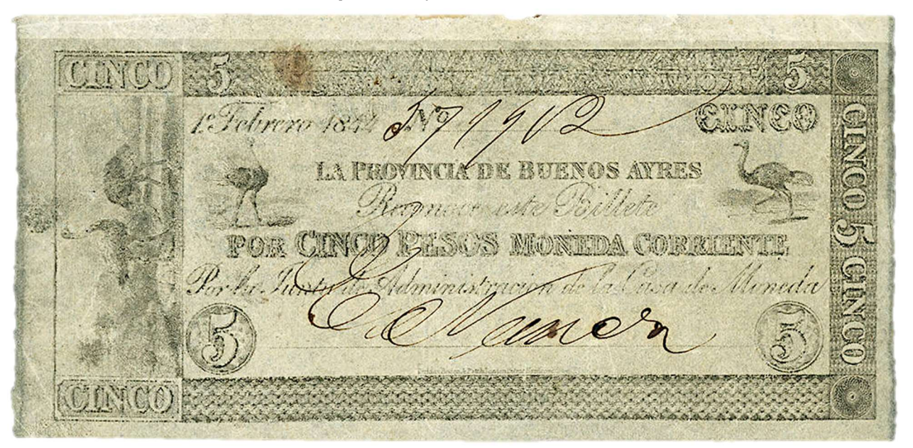
photo Museo y Archivo Históricos del Banco de la Provincia de Buenos Aires "D<sup>r</sup> Arturo Jauretche «

PS-404 NC-159 BA-57 1^{\circ} Febero de 1844 both legends are crossed out but remain partially legible