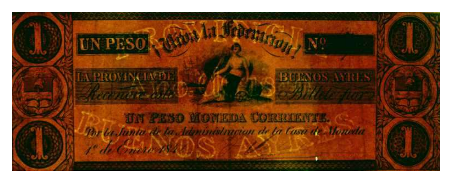
The watermark can be read from the obverse or reverse, and be fully or partially visible.